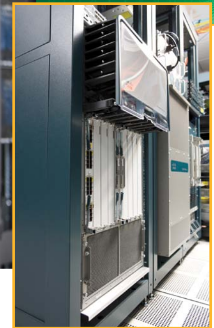
Cisco IT anticipates that Nexus-based pods can reduce in the number of access and distribution switches by up to 80%.

along with Cisco Catalyst 6500 Switches in a controlled production environment in Mountain View, California: