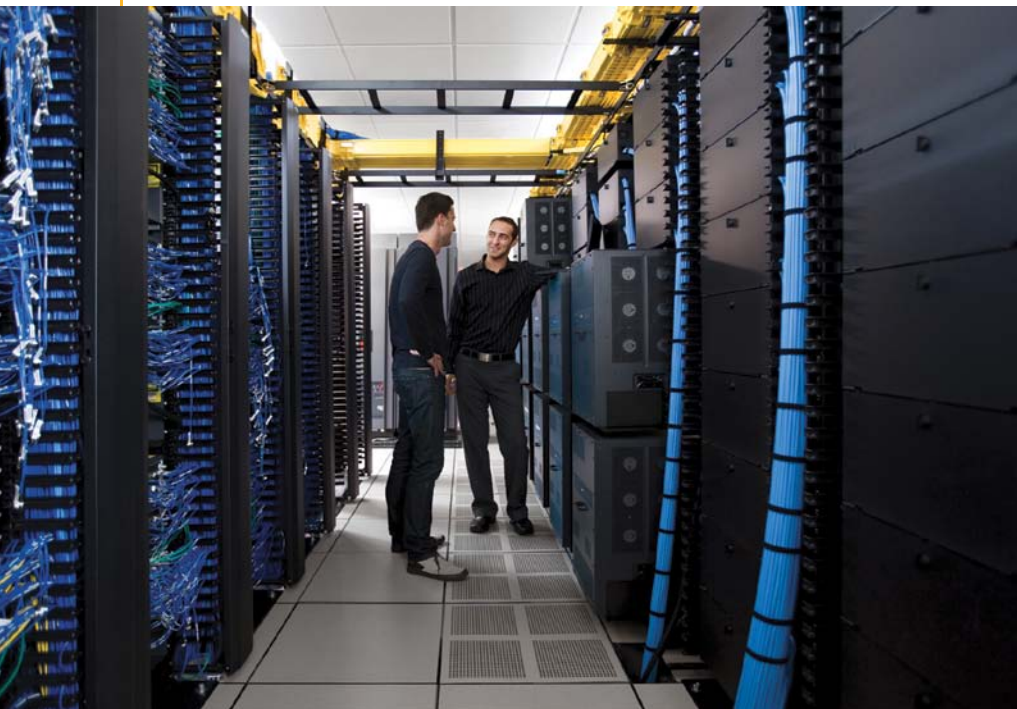
Cisco IT is transforming its data center in order to realize the company's Data Center 3.0 vision, which employs a unified fabric to connect servers and storage devices.

Cisco IT anticipates that the initial deployment will result in a low-risk experience since it is only being used as an access technology and not across the whole data center. Increased port density among the Nexus switches will provide for increased scalability in the data center. Operational costs will be reduced both at the system and the data center level. Lower cabling costs, faster provision, improved SAN performance and a much more efficient IT organization are among the various other benefits that Cisco foresees.