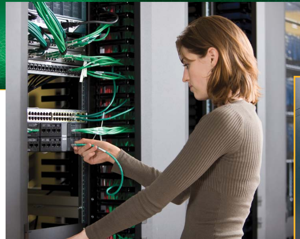
Cisco IT needed a new data center architecture that would consolidate I/O at the access layer and increase bandwidth in the core. They wanted to improve operational efficiency by standardizing on Ethernet and IP standards-based technologies whenever available, which made Fiber Channel over Ethernet the preferred choice.

In September 2008, Cisco IT deployed the Nexus 7000 and 5000 Switches